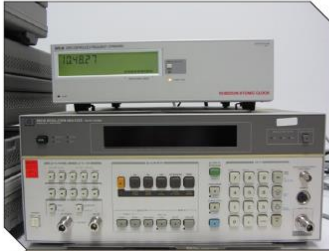
Frekans standardı ve modülasyon analizörü