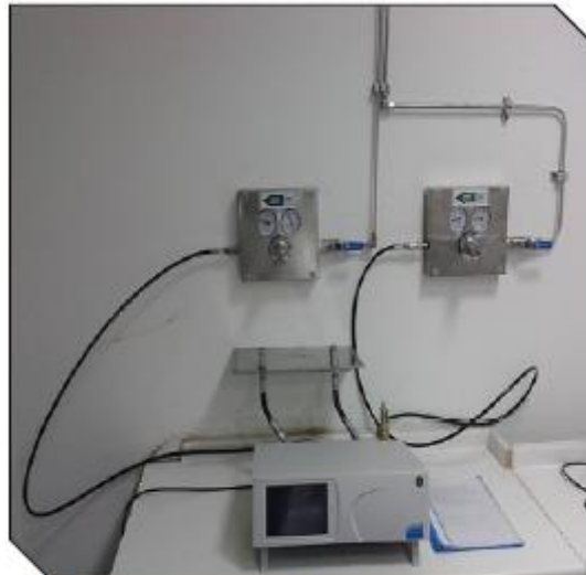
Azot tüplü otomatik basınç kalibratörü