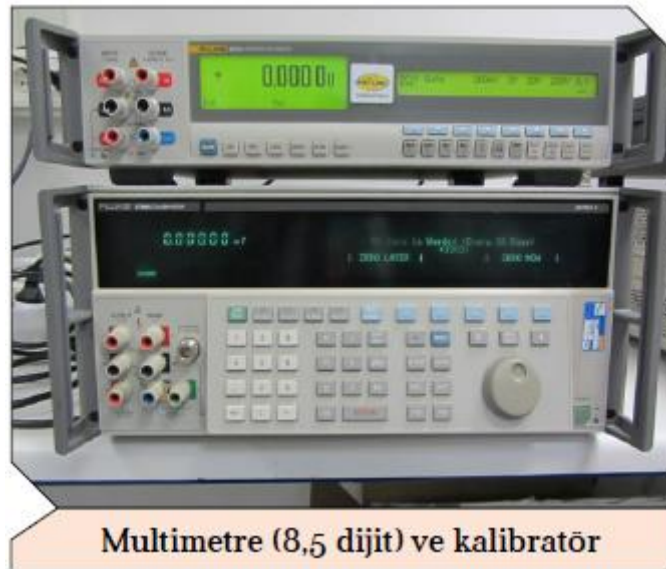
Multimetre (8,5 dijit) ve kalibratör