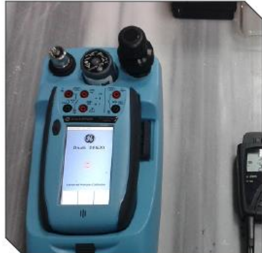
Manuel pompalı basınç kalibratörü